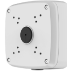
PFA121 Junction box